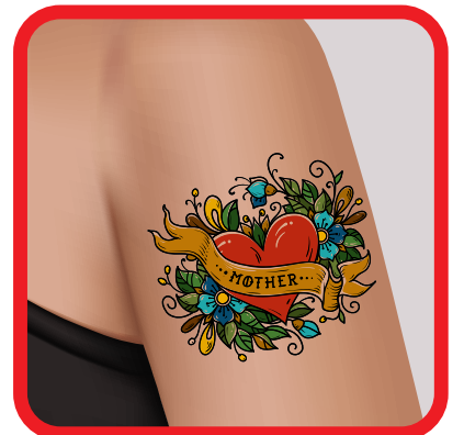
Body art facilities, and tattoo services