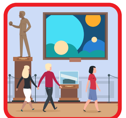
Museums, Historical sites and Galleries