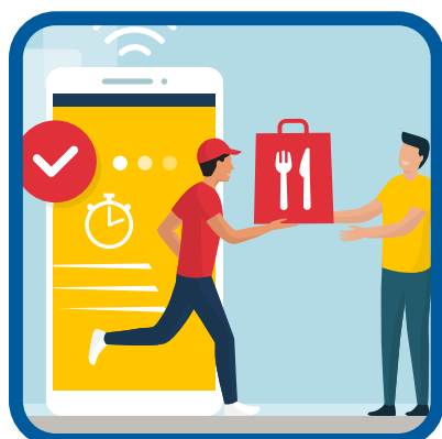
Restaurant take-out, curbside pickup, drive-thru, and delivery only

If you have specific questions that absolutely require a response, please contact a JCDH representative 205.930.1230 or 205.930.1260, Monday – Friday, 8am-4:30pm. We ask for your patience as call wait times may be longer than usual.