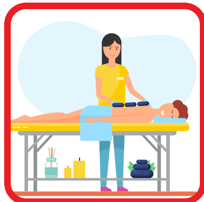
Massage therapy establishments and services