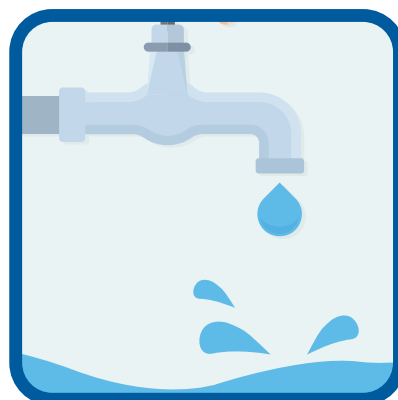
Utilities (water, gas, electricity)