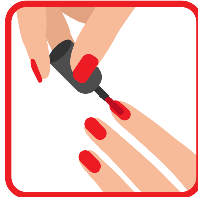
Nail salons and spas