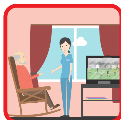
All Senior Citizen Center gatherings shall remain closed