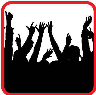
Concert venues and auditoriums