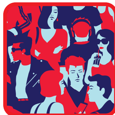
Social clubs, Fraternity and Sorority meetings and events