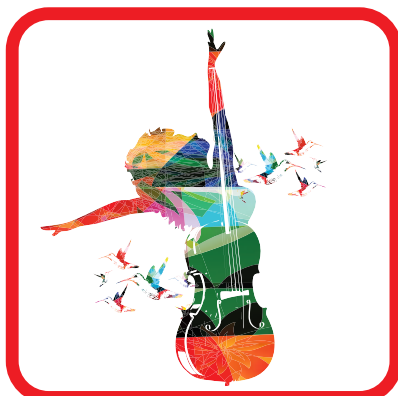
Performing Arts centers, events, rehearsals