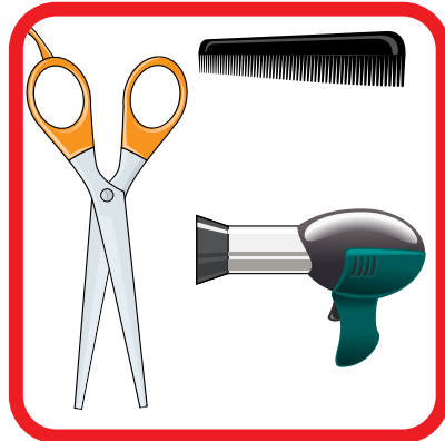
Barber shops, hair salons, waxing salons, and threading salons