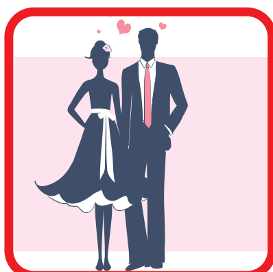
Proms, Formals and other similar events