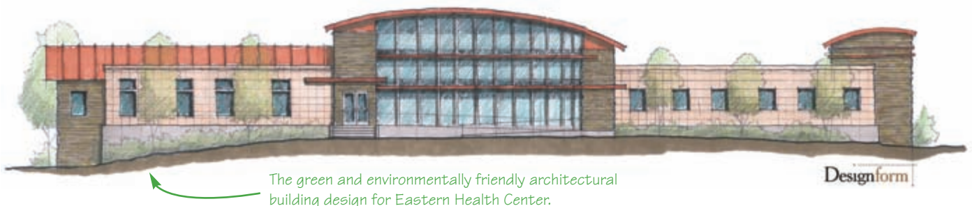
The green and environmentally friendly architectural building design for Eastern Health Center.