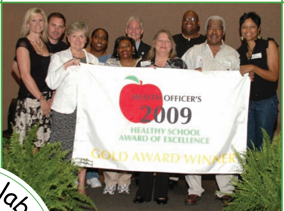
Representatives from Cahaba Heights Elementary the 2009 Gold Healthy School Award of Excellence winner.