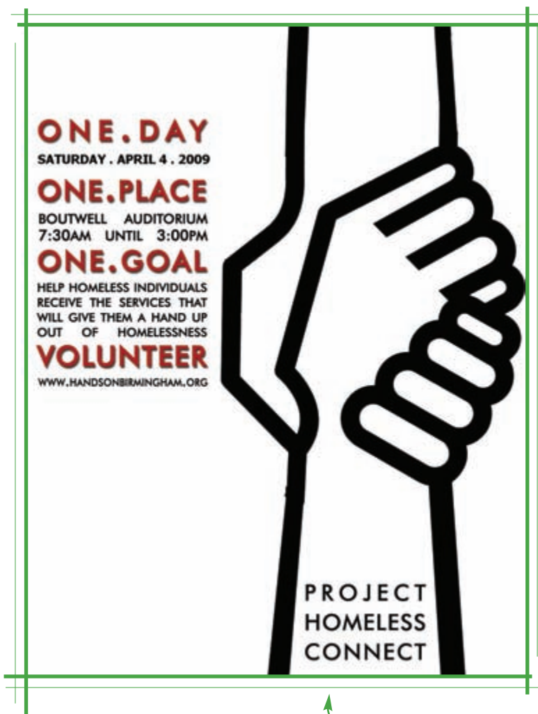
Publicity materials for the Project Homeless Connect event held in April 2009.

In a continued effort to prevent sexually transmitted diseases in Jefferson County, the Sexually Transmitted Disease Program examined nearly 11,000 patients in the JCDH STD clinic. In conjunction with the Alabama Department of Public Health, the division completed a two-day mass syphilis screening of over 1,500 inmates at the Alabama Department of Corrections St. Clair County facility to prevent the spread of syphilis among inmates. As an educational outreach for high risk individuals, the division conducted 12 STD/HIV education programs in local jails, substance abuse facilities and in the community at large. Through these outreach efforts, 525 persons were screened for syphilis, allowing for proper treatment and follow-up of new infections. The Sexually Transmitted Disease Program has enhanced its surveillance efforts, in partnership with UAB, through the STD Surveillance Network, funded by a $1.125 million CDC grant.