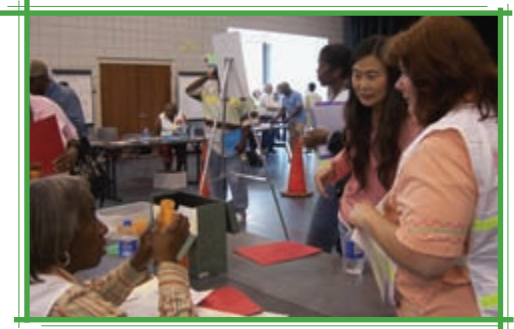
JCDH employees participate in the department wide points of dispensing training exercise.

The JCDH Incident Command System was activated in order to properly plan and prepare for the Jefferson County response to the H1N1 2009 pandemic. With the activation of the Incident Command System, JCDH responded in a coordinated fashion by monitoring school absentee rates, assessing hospital needs, answering calls from the public, interviewing patients and conducting presentations for community groups/organizations. Throughout the summer and early fall, education, investigation, surveillance and planning efforts were continued in preparation for mass vaccination clinics. In collaboration with the Alabama Department of Public Health, the Emergency Preparedness & Response division assisted in these response activities. The mass vaccination efforts were targeted to the public via the six JCDH Health Centers and public schools. In 2009, over 16,508 immunizations were administered. H1N1 2009 influenza provided an opportunity to use resources and services to respond to an emergency health threat in our community. Our response and preparedness efforts helped ensure a protected health environment for the communities of Jefferson County.