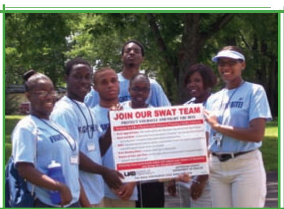
Local residents participate in Project Moondust neighborhood canvassing activities for mosquito prevention.