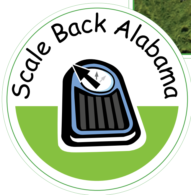
Logo for the statewide Scale Back Alabama weight loss initiative.