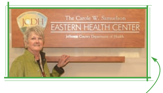
Sign at the front entrance of Eastern Health Center.