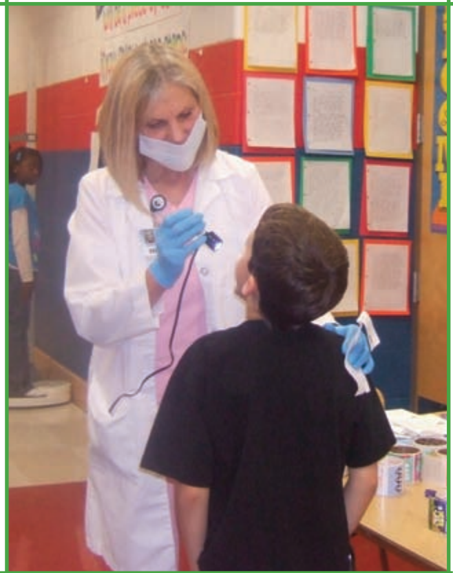
JCDH dentists perform oral health screenings at local elementary schools.

H ealthy communities have healthy residents in greener tomorrows, and JCDH continues to provide health care services to those in need. Our 4 community based dental clinics and 3 mobile clinics provided comprehensive dental services to 6,271 underserved residents of Jefferson County in 2009. Dental Services was engaged in community outreach by providing 96 dental extractions to 46 homeless adults at the Homeless Connect effort. In the summer of 2009, a mobile unit provided comprehensive dental care to 94 women and children at the Lovelady Center. An onsite and mobile clinic at UCP LINCPoint provided comprehensive dental care and education to 77 patients, and 57 residents at the Jefferson Rehabilitation Center received free care. Our three mobile units provided free dental care to 462 low income children at local elementary schools. At 23 elementary schools throughout Jefferson Country, JCDH provided an oral health assessment to 3,494 kindergarten and 3rd grade children to assess unmet dental needs among elementary school children. To ensure adequate dental and health care services to our clients, the International Programs initiative strives to provide access to our services and programs for international communities through collaborations with community-based programs and interpretative and translation services.