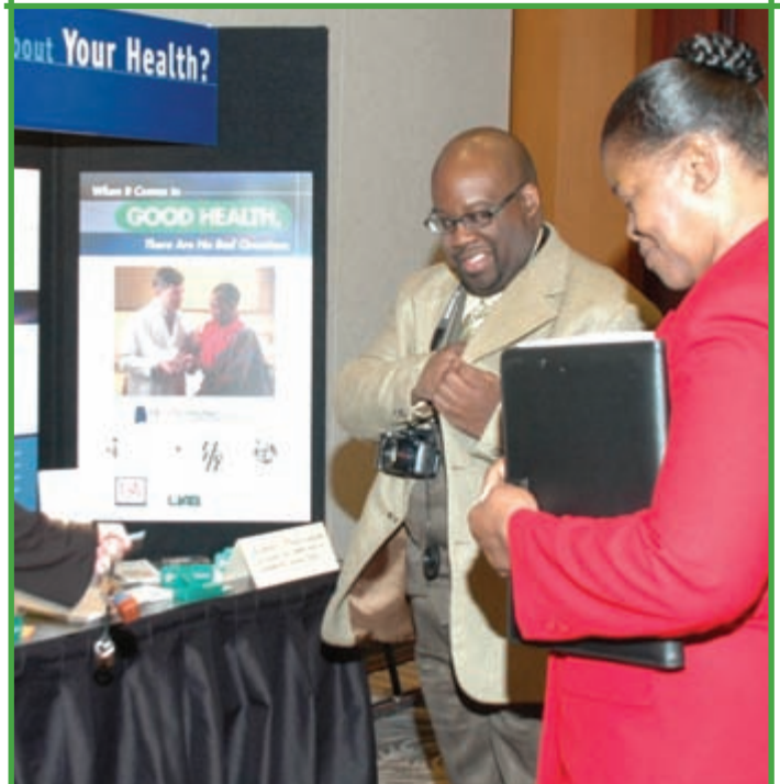
Summit participants visit the vendor booths at the conference.