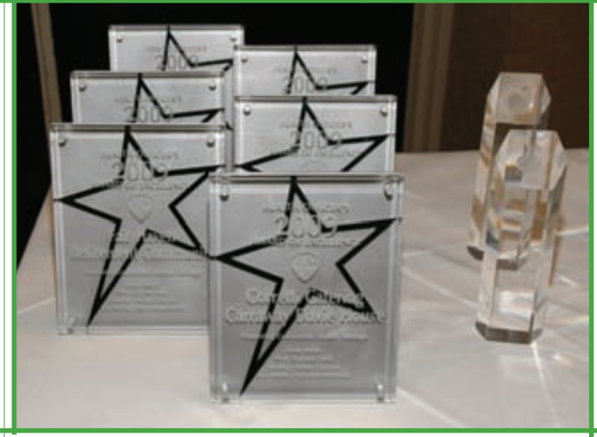
Health Officer's Award of Excellence display.

Cleaner environments that promote health for the residents of Jefferson County include tobacco-free environments. In order to provide county leadership for reducing tobacco use in the county, the Tobacco Prevention & Control Program conducted 8 Clean Indoor Air presentations, trained 64 health care workers in the Ask, Advice, Refer, and Prescribe program, trained 271 people on Smoke Free Homes and collected 194 Smoke Free Home pledges. Other program activities in 2009 included 9 worksite presentations, investigation of 4 smoking complaints, and conducting a Diabetes and Tobacco Use Forum at Beulah Missionary Baptist Church. Through a Youth Empowerment Program, Tarrant's High School students conducted presentations for the Board of Education and the City Council to advocate for a Smoke Free City Ordinance. JCDH was awarded a "Not on Tobacco" grant for a youth smoking cessation class that was implemented at Parker High School. In order to emphasize tobacco free and other messages, the Public Relations and Graphic Design Divisions used risk communications to disseminate various urgent messages to residents which encourage individuals and communities to make healthy decisions. While working to communicate effectively with the public, Public Relations and Graphic Design strive to use sustainable, green practices in communication, such as converting printed programs and announcements into electronic PDF files or CD's.