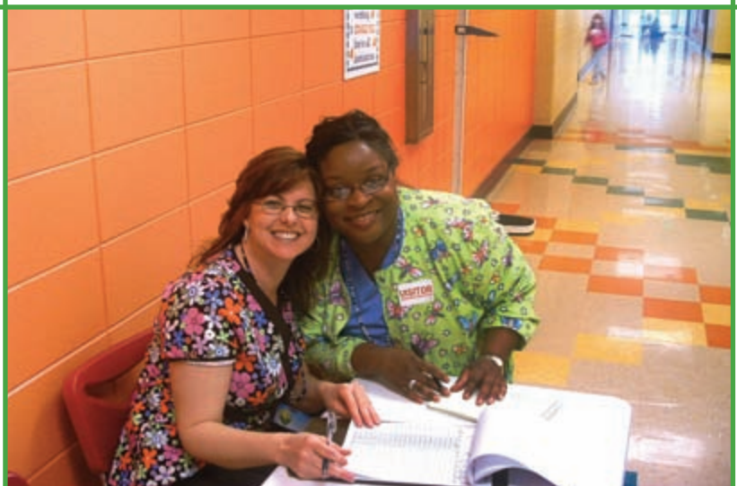
Health department employees wait to register school children for oral health screenings.