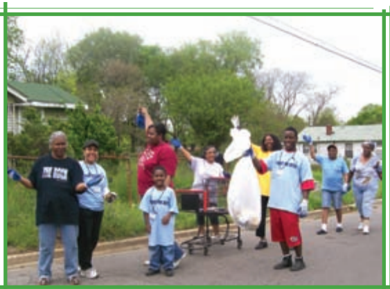
Project Moondust neighborhood cleanup day to improve mosquito control.

Food & Lodging Protection ensures the health of local residents and visitors by enforcing food safety laws and regulations. In 2009, Food & Lodging worked to protect the public by conducting 8,464 food inspections and 389 facilities inspections; investigating 1,396 complaints; permitting 3,769 food establishments, 465 facilities, 126 lodging establishments, 30 jails, 68 communal living facilities and 238 schools; and reviewed 260 plans for new establishments. To ensure trained food handlers throughout the county, JCDH conducted 679 food handler training classes for 16,587 food handlers. As a new requirement for food manager certification in food establishments neared implementation, JCDH conducted 12 ServSafe manager classes and trained 245 food managers. Striving toward excellence, JCDH formed an action plan to meet FDA standardization criteria and completed a self assessment of food establishments for a Self Assessment of National Risk Factors Study. This year Food & Lodging has implemented electronic complaint investigations and notices of violation, reducing the amount of paper used for these investigations by over 8,400 paper records. Environmental stewardship efforts such as this help to ensure illness prevention and a greener tomorrow for Jefferson County.