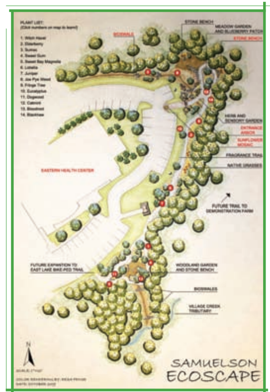
Artist's rendering of the Samuelson ecoscape located adjacent to Eastern Health Center.