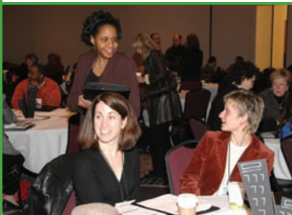
Health Action Summit attendees participate in round table discussions.