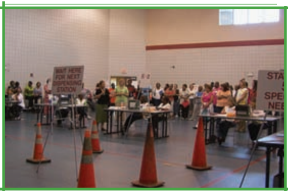
Points of dispensing employee training day is set up at the Gardendale Civic Center.