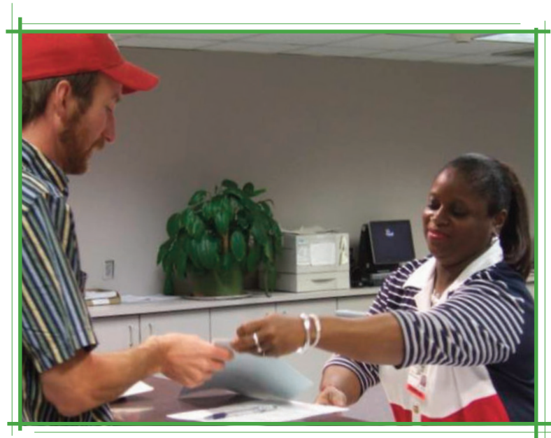
Vital records staff providing services and assistance to Jefferson County residents.

A s a service to the Jefferson County community, JCDH provides copies of vital records to the public by phone or, mail order and direct customers. Copies of birth, marriage, divorce or death certificates are available to the public by application for $15 per certificate. Certificates are available for customers in person in about 15 to 20 minutes, and all phone and mail ordered certificates are sent out the same day. In 2009, the Vital Records Division issued 39,546 copies of birth certificates, 63,266 copies of death certificates, 1,581 copies of marriage certificates and 354 copies of divorce certificates. The division also handles death certificates from Jefferson County funeral homes, which are entered into the system on a daily basis, checked for errors, corrected, copied and sent to Montgomery the next day.