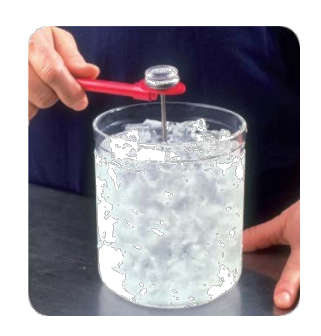
2. Put the thermometer stem or probe into the water.